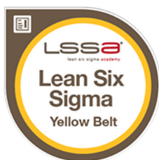
Figure 1 – Digital badge

Lean Six Sigma training is provided by a global network of ‘Accredited Training Organizations’ (ATOs). These ATOs provide training programs that are aligned to the LSSA Skill sets. Examination is provided through the LSSA directly or through APM Group Limited. The exams are open to all. Individuals can apply directly or sign up via one of the ATOs. It is recommended that candidates receive training through an ATO to prepare for certification. Check the LSSA website for an overview of ATOs and the actual exam requirements. On the website you will also find information about how you can claim your Digital badge. Then share your Digital badge on LinkedIn and show that you are active as a Yellow Belt.